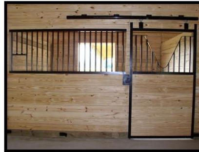
2) Stall Front Kit w/ Feed Opening and V-Neck Stall Door