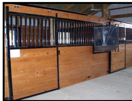
4) Stall Front Kit w/ Swing-Out Hay Feeder