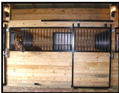
3) Stall Front Kit w/ Swing-Out Door