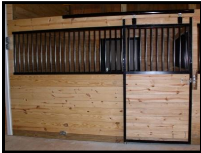
1) Stall Front Kit